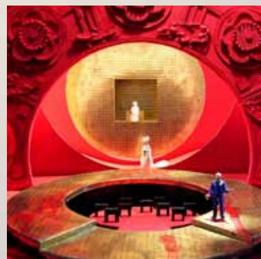
Set model/Minnesota Opera

For information on wheelchair accommodations at Benedum Center, call 412-281-0912.