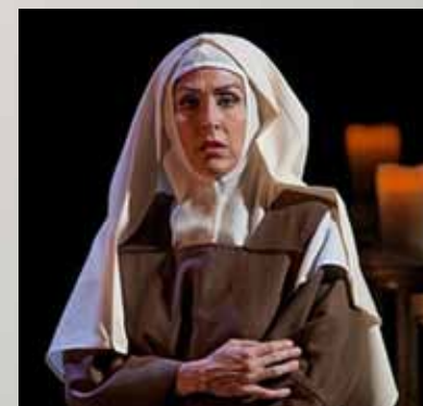
Austin Lyric Opera