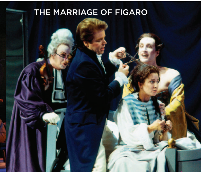
THE MARRIAGE OF FIGARO