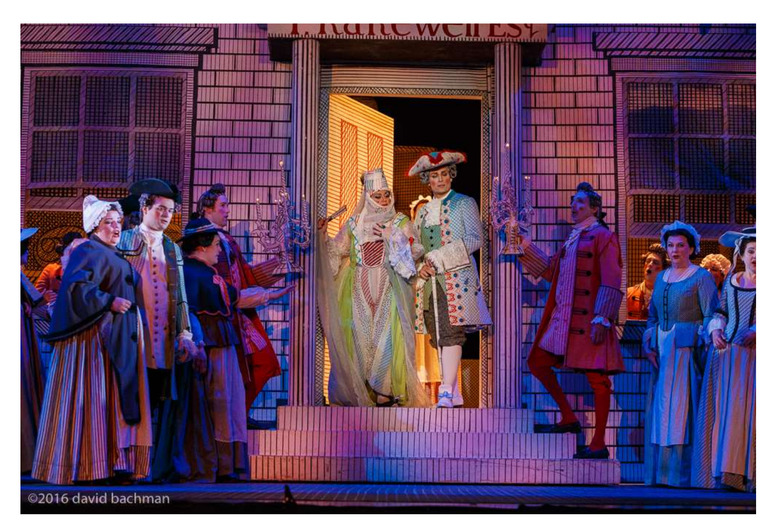
Act 2 - Scene 2 Street