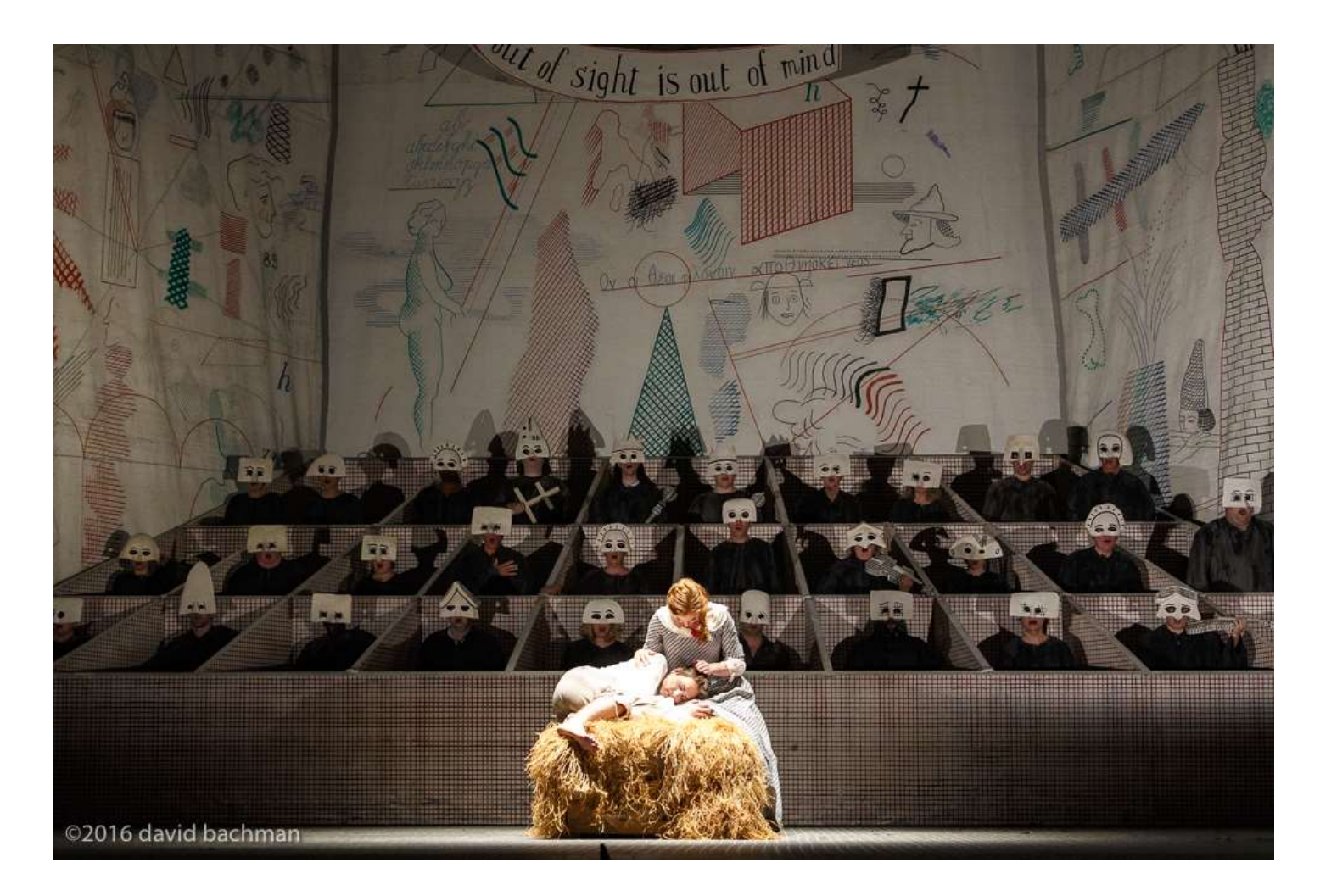
Act 3 – Scene 3 Bedlam