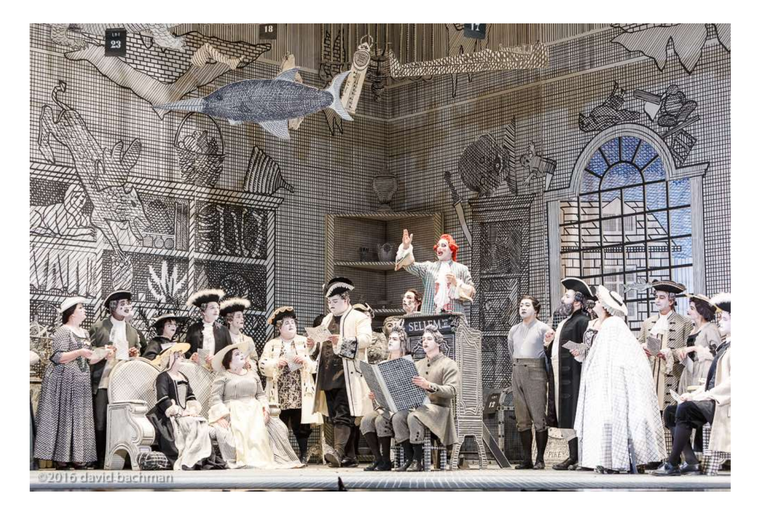
Act 3 – Scene 1 The Auction