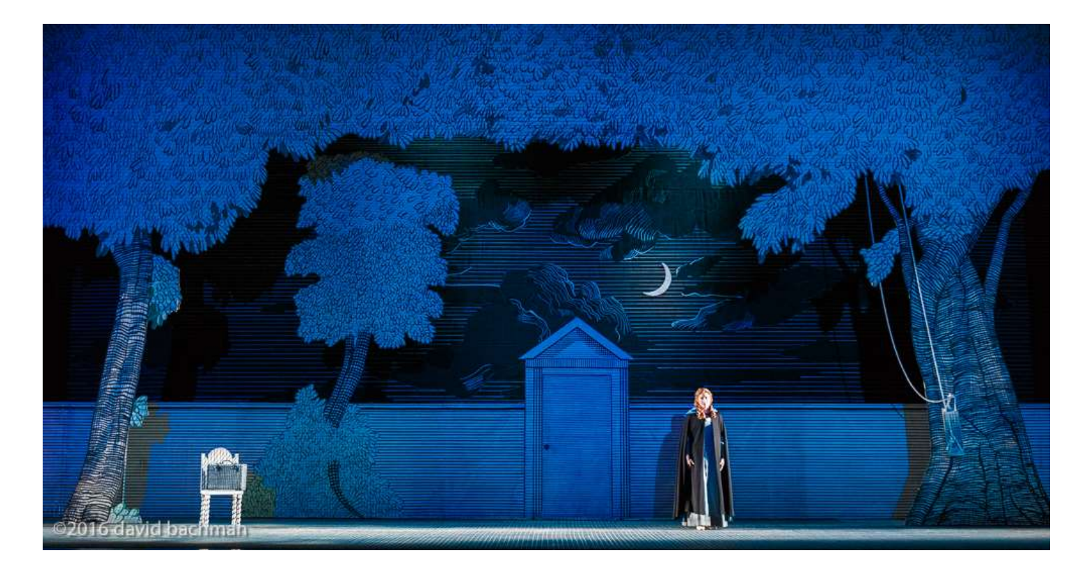
Act 1 - Scene 3 Garden