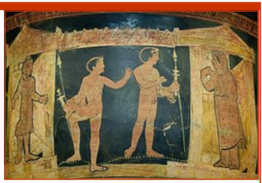
Ancient Greek vase showing Orestes and Pylades meeting Iphigenia in Tauris

A storm batters Diane's temple at Tauride. Iphigénie and the other priestesses—all of them captives from Greece—ask the gods for safety and peace from the storms raging both outside and within their hearts. Iphigénie relates a dream: her home was destroyed; her father was killed by her mother,