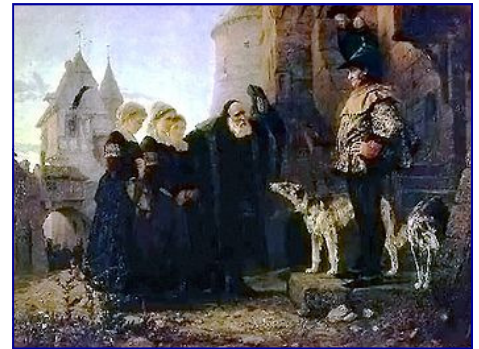
Le droit du Seigneur (1874) by Russian painter Vasily Polenov (1844-1927)

In the 1850s a widespread quarrel broke out over the reality of the droit de cuissage , which jurists, philosophers, and playwrights had made into an emblem for seigneurial oppression. Cuissage obstinately continued to enjoy popular belief, leading to art works and writings that defended the progress of history. Participants in the intense debate combed available texts, bringing to light most of the legitimate medieval documentary sources. Few sources have appeared since. The controversy helped to construct a new image of the Middle Ages as a time of strangeness, polarizing interpretations of the Middle Ages and gradually molding contemporary ideas into fact. From the Middle Ages to The Marriage of Figaro to Mel Gibson's Braveheart , the ultimate symbol of feudal barbarism is still the droit de seigneur .