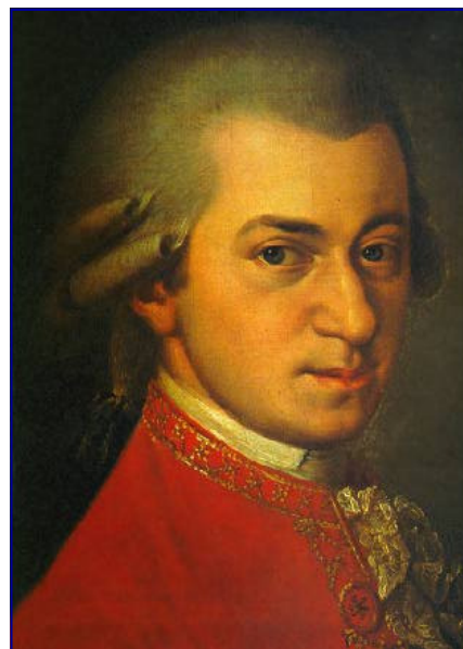
Wolfgang Amadeus Mozart (1756-1791), classical composer of over 600 works, including operas in German and Italian